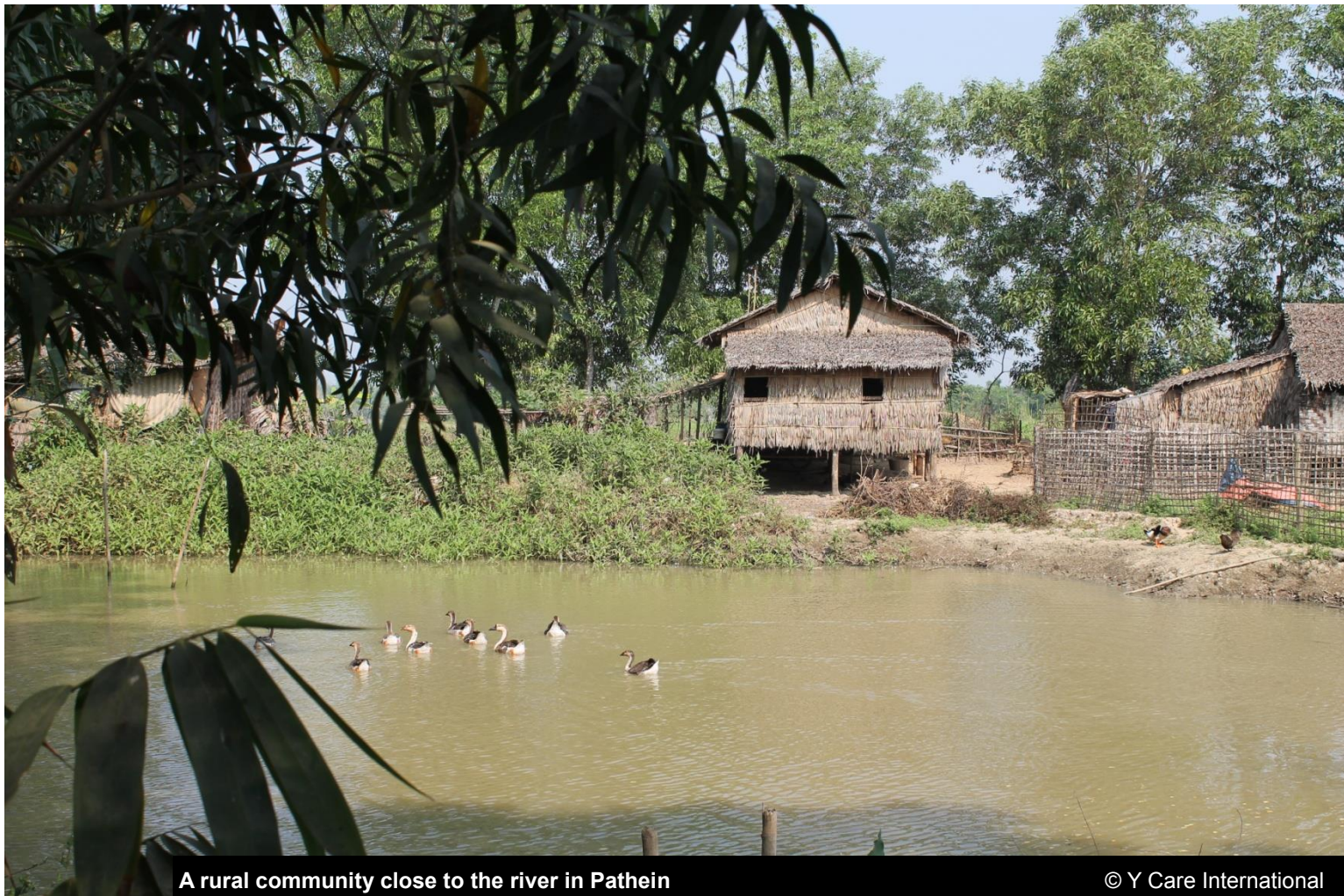
A rural community close to the river in Patheingyi