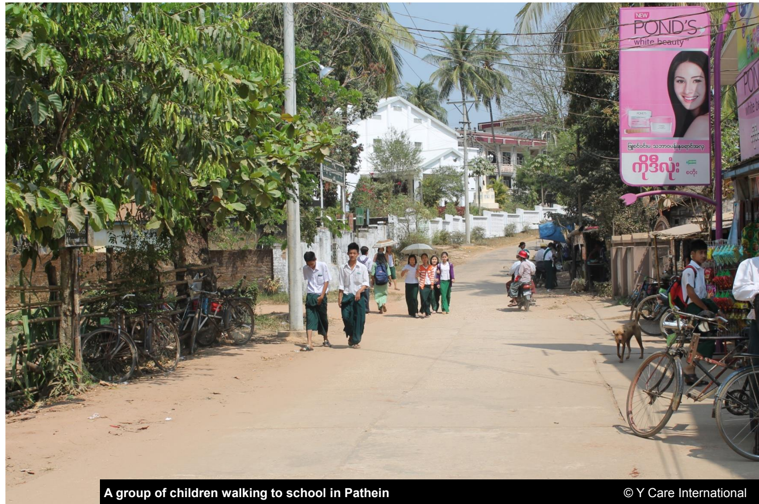
A group of children walking to school in Pathein