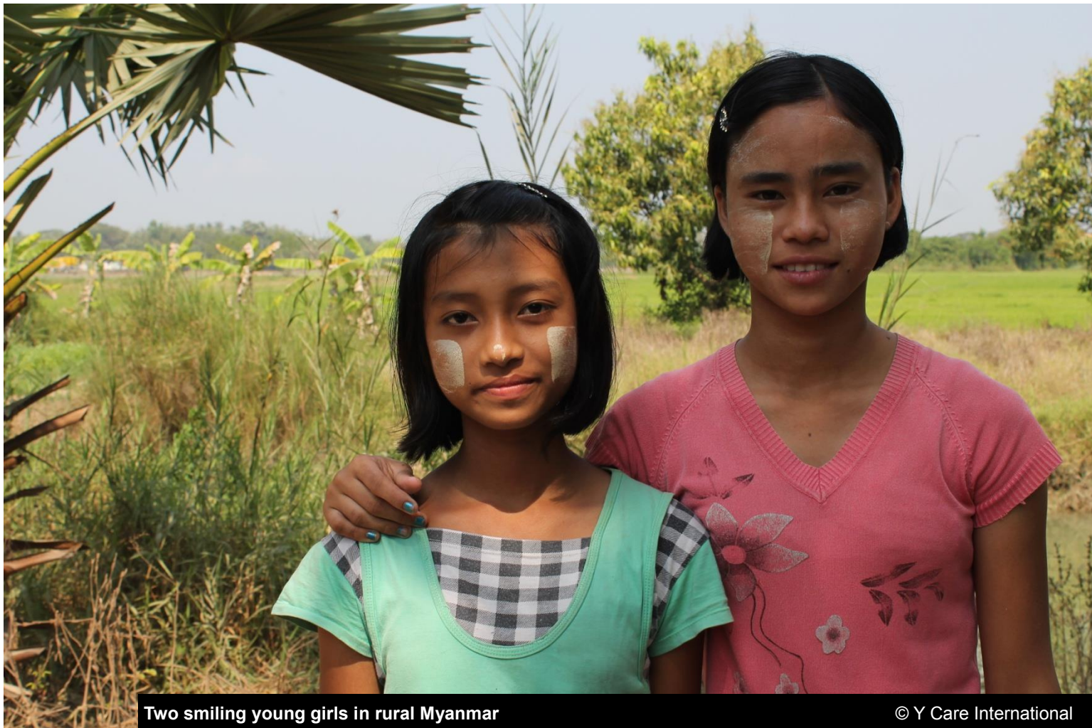
Two smiling young girls in rural Myanmar