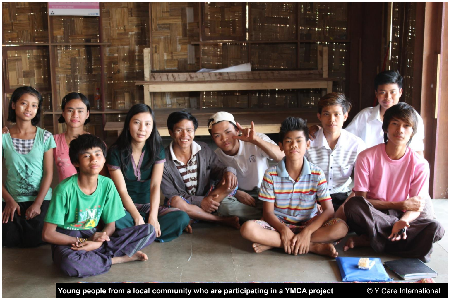
Young people from a local community who are participating in a YMCA project