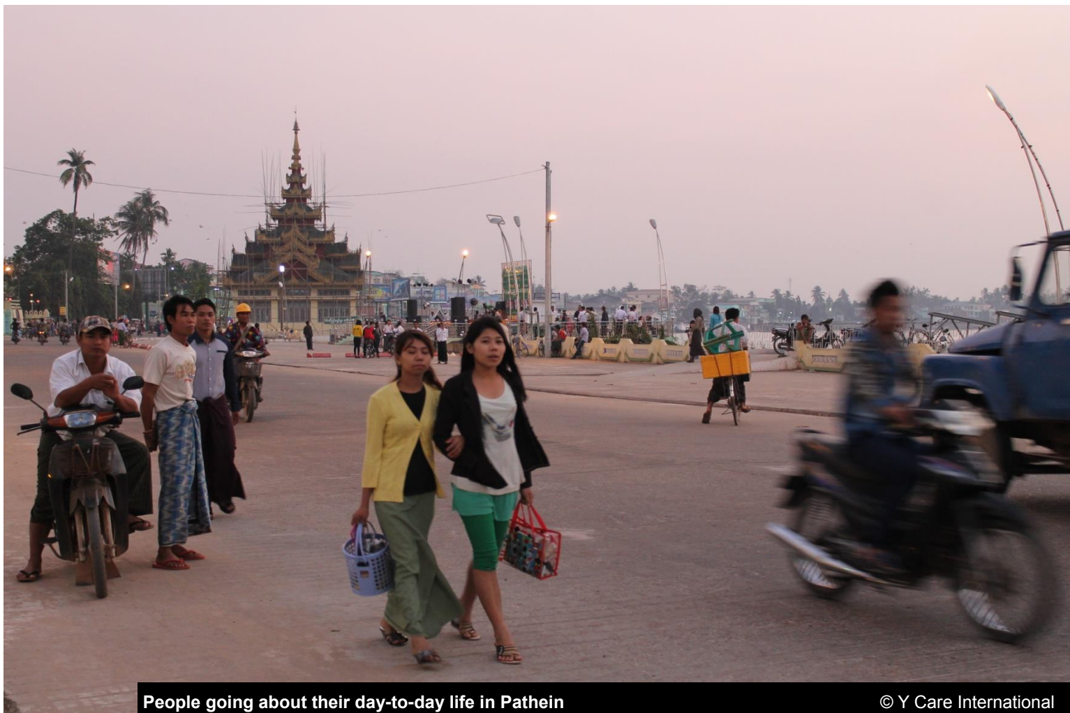
People going about their day-to-day life in Patheingyi