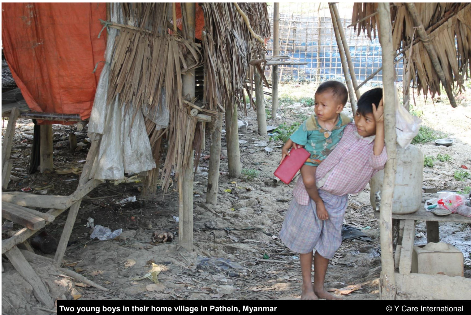
Two young boys in their home village in Patheingyi, Myanmar