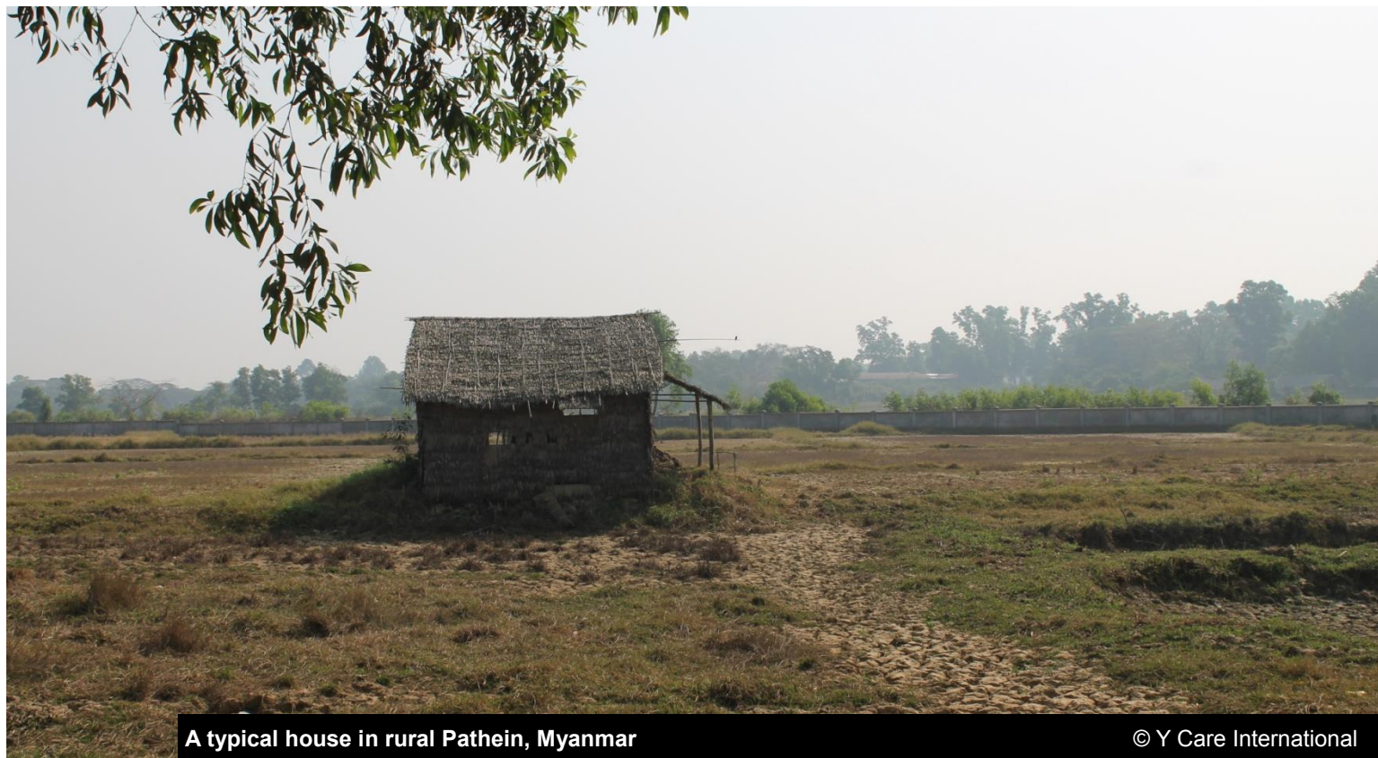
A typical house in rural Patheingyi, Myanmar